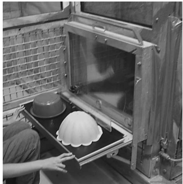
Figure 1. Apparatus. Chimpanzees and bonobos chose between fixed and risky rewards hidden under bowls.

In choices between a fixed and a risky reward option (using choice trials from all sessions), chimpanzees were risk seeking (mean \pm s.e. proportion choosing fixed option, 0.36 \pm 0.04 ), significantly preferring the risky reward ( t(4) = -3.48 , p = 0.025 one sample t -test, all reported comparisons are two-tailed). In contrast, bonobos were risk averse ( 0.72 \pm 0.03 ), preferring the fixed reward to the risky ( t(4) = 6.40 , p = 0.003 ).